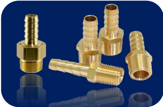
Brass Hose Nipple and Fittings

(All types of copper and copper alloys, SS, MS Etc.)