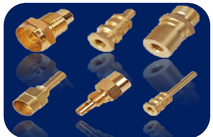
Brass Automotive Parts-6

Email: info@jnbrass.com , sales@jnbrass.com