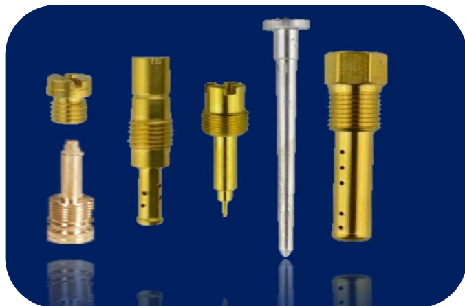
Brass Automotive Parts-5