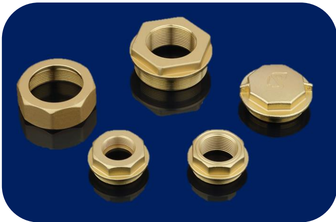
BS 746 Nuts