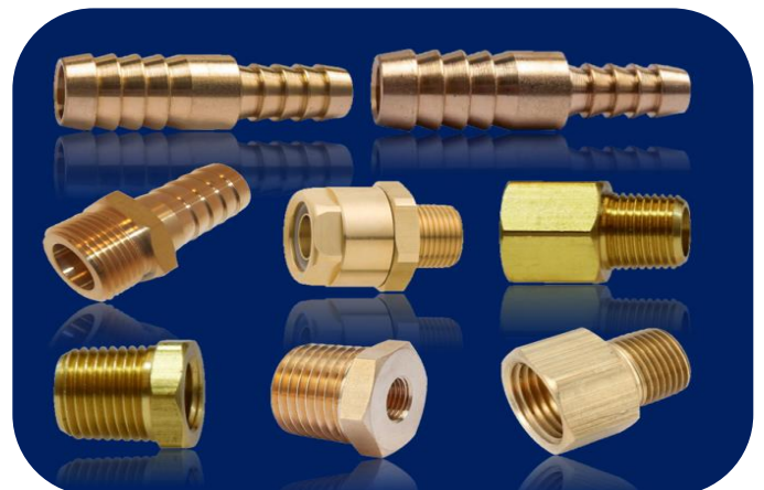
Brass Hose Fittings parts-6