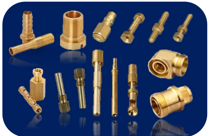
Brass Automotive Parts-4