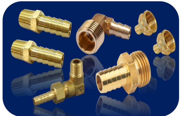
Brass Hose Fittings parts-2