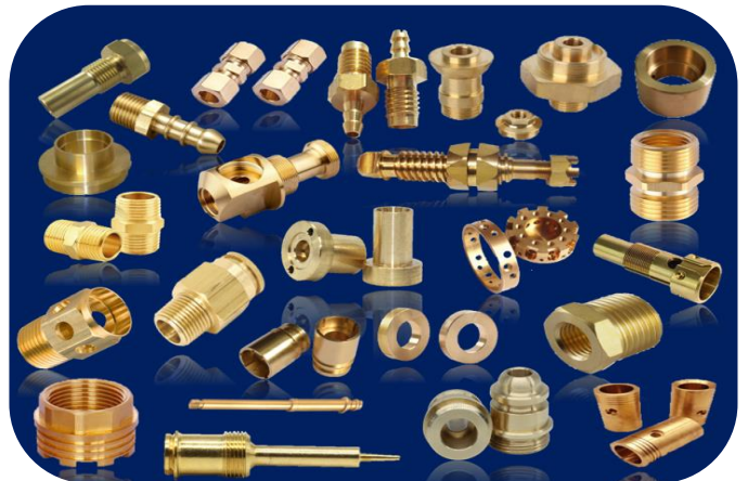
CNC Turned components