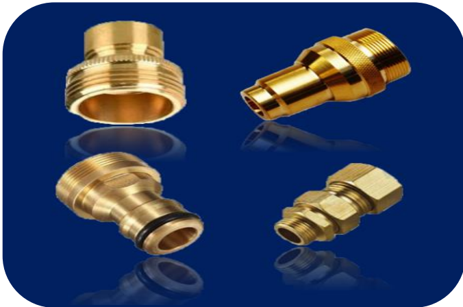
Brass Automotive Parts-3