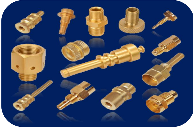
Brass Automotive Parts-1