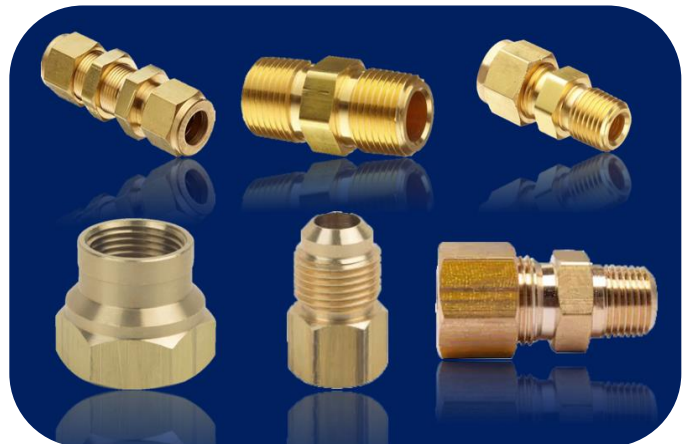
Brass Hose Fittings parts-4