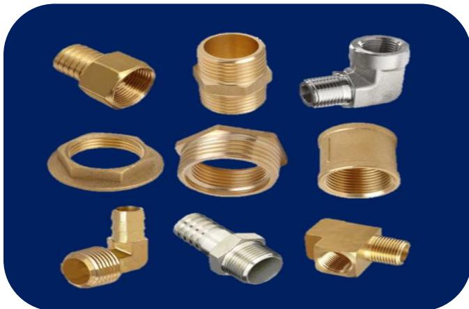
Brass Hose Fittings parts-5