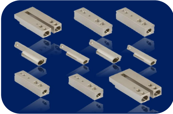
Brass Meter Terminal Block