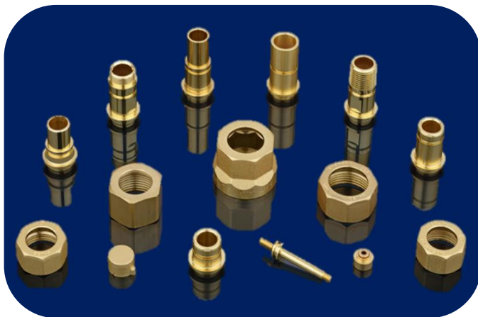
BS 746 Standard Gas Meter Regulator Parts