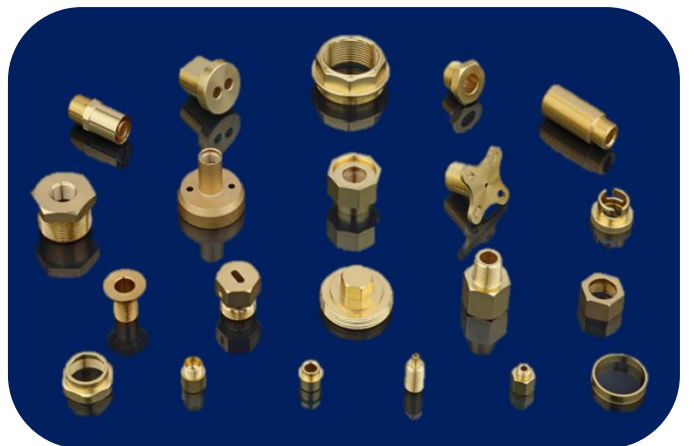
CNC Turned components