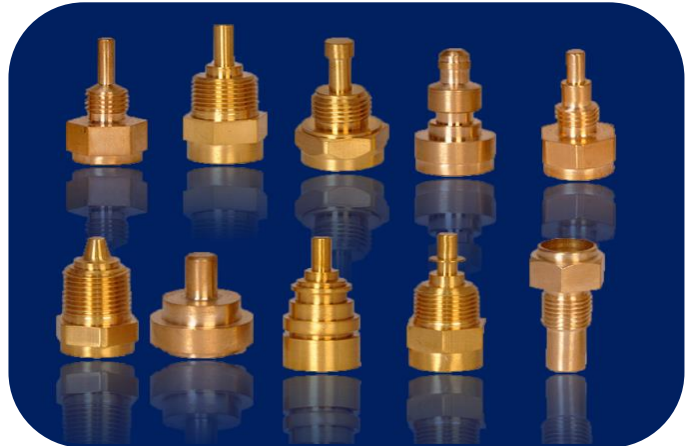
Brass Automotive Parts-2