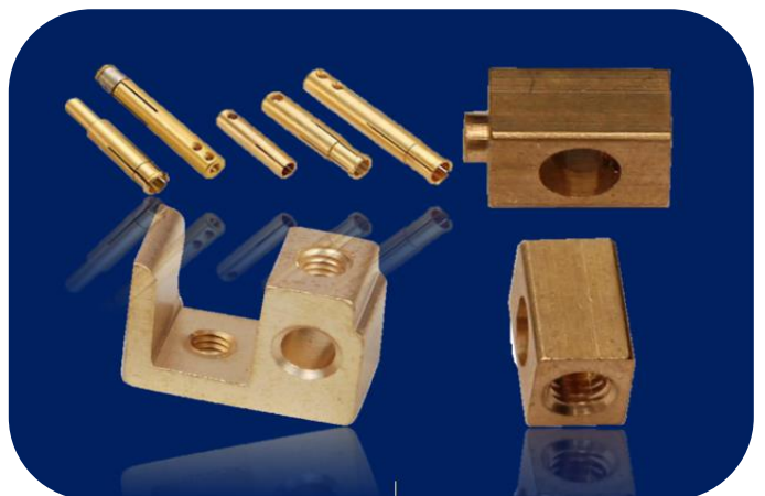
Brass Electrical components