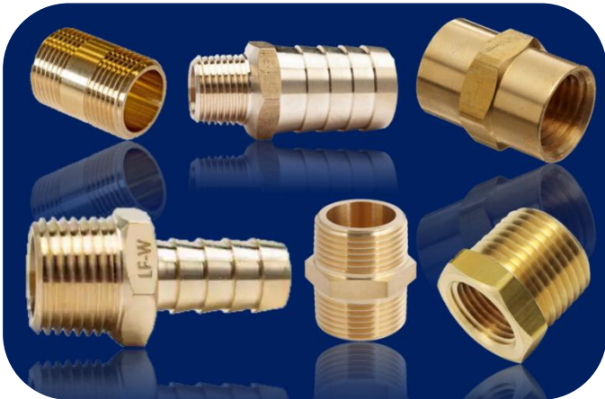
Brass Hose Fittings parts-3