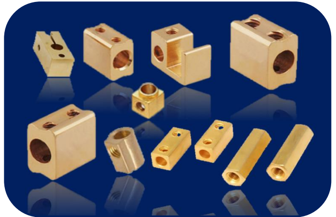
Brass Electrical connector parts