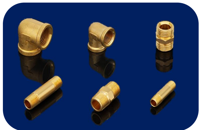
Brass Pipe Fittings

Email: info@jnbrass.com , sales@jnbrass.com